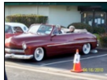
Bill & Willie pulling out of the motel to go CRUISING