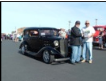
Alvin Sease's 1933 Chevy