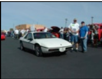
Jim Decke's 1986 Pontiac Fiero