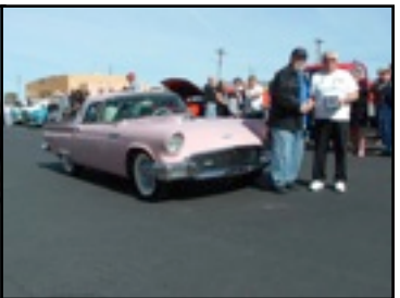
Ken Light's 1957 Ford Bird