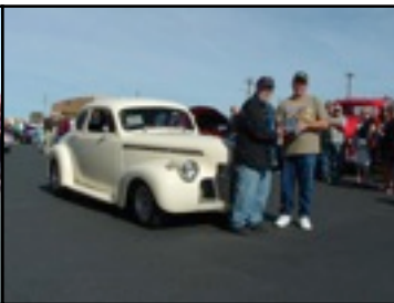
Wayne Young's 1940 Chevy Coupe