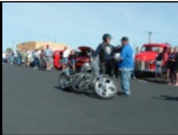
Veron Samson's 2008 Custom Bike